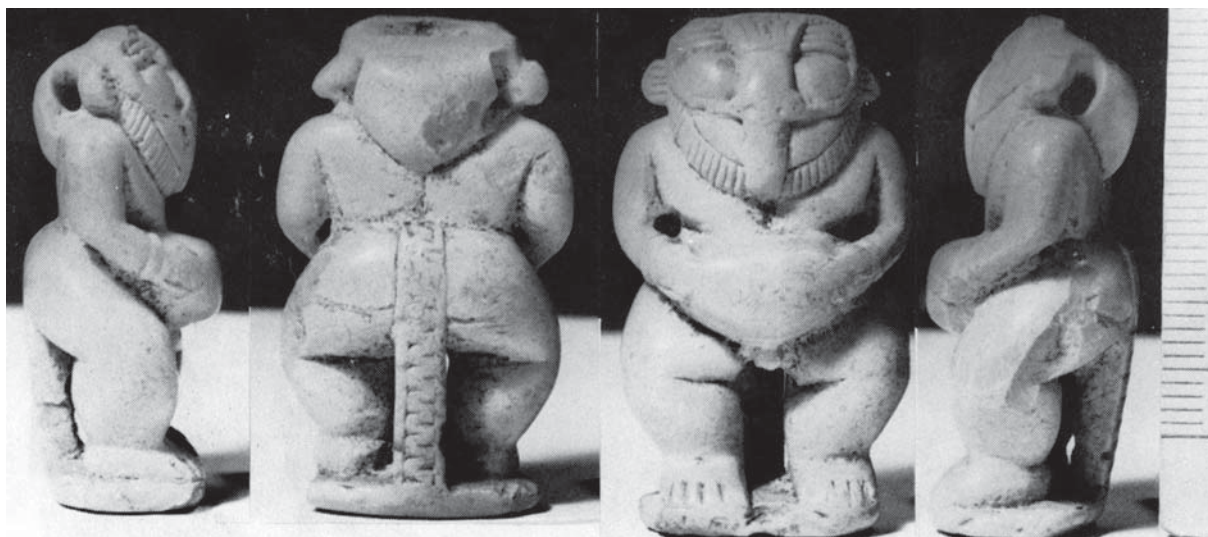
Fig. 4: The Bes of a private Swiss collection, after Chappaz 1981, 93.

synthesis, following the principle of adaptation of models, in order to express canons (funerary or not) respecting Egyptian traditions, and, at the same time, indigenous forms. Therefore, artistic experimentation took place creating a local trend, probably coming from a melting pot between popular background and poorly known traditions. As a solar and prophylactic image, Bes had a very good reception in both official and popular beliefs until the Meroitic period. We hope that new discoveries from the field can enlarge the collection of these Bes with pentagonal face adding new local variants of the same divinity.