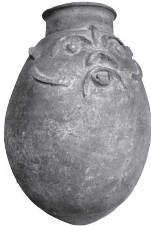
Fig. 1: The Bes-jar from tomb 772 of Sanam necropolis, unpublished photograph, © Royal Pavilion & Museums, Brighton and Hove.

However, during the Napatan dynasties, Bes image is frequently present among the components of jewelry and as amulets left inside the burials due to his apothropaic role, especially in non-royal tombs. 7 In general, Bes-amulets followed the standard models of the Third Intermediate Period and the Late Period: lion-rounded face, flat nose, wide mouth with thick lips, sometimes a feathered headdress on the head, and a necked dwarf body with arched and short legs. In Nubia, among the amulets