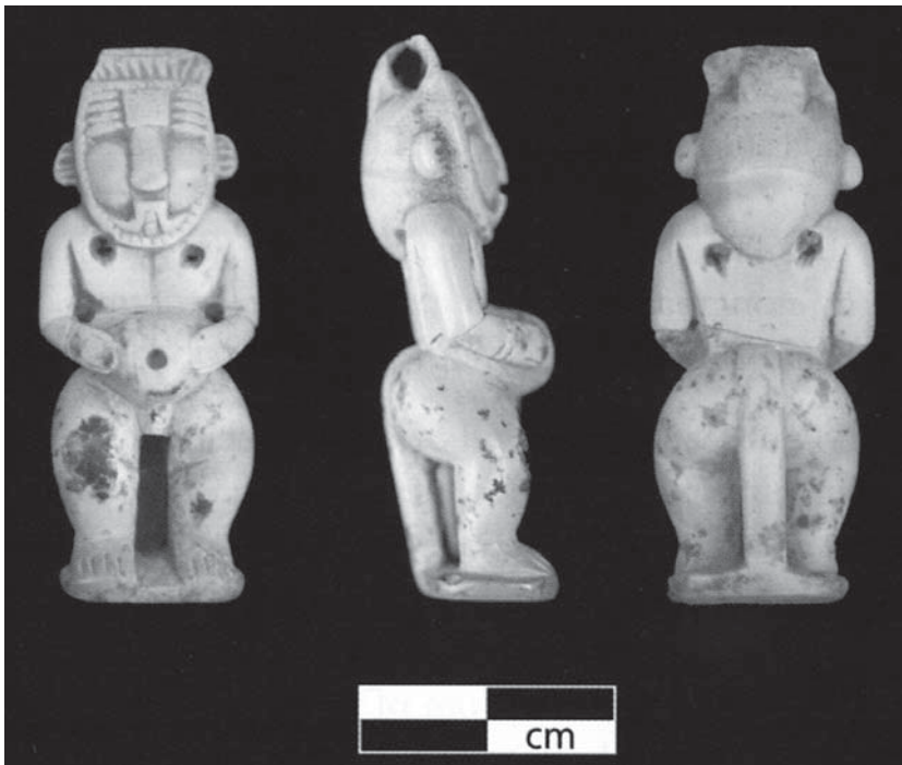
Fig. 3: The Bes recently found at Amara West, after Binder 2011, pl. 12, 46.

in the Egyptian Bes of the same period, i. e. a lower attachment of a feathered headdress which, in these Nubian models, has never been made.