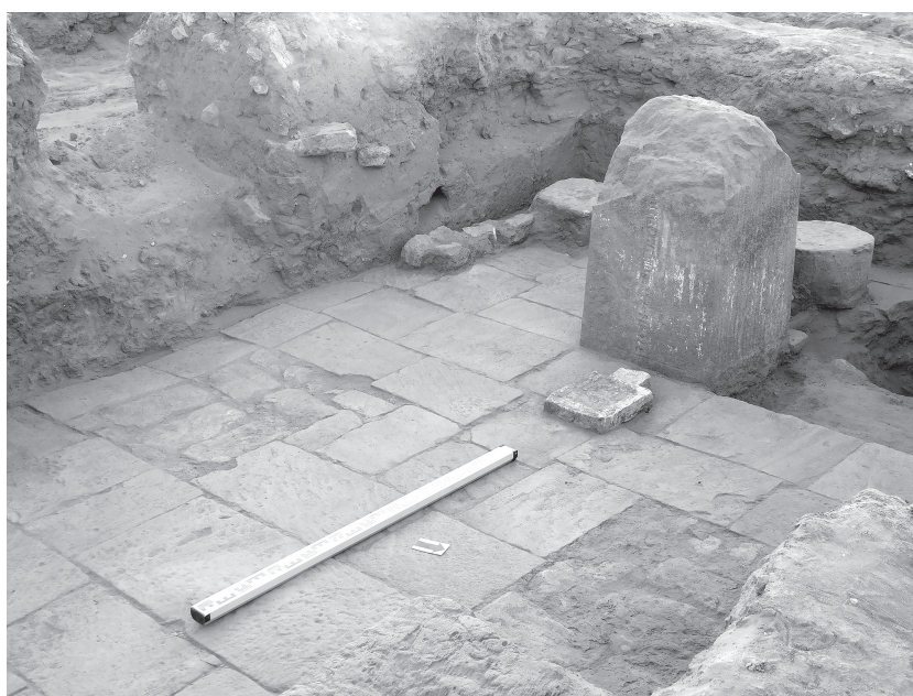
Fig. 3: Abu Erteila, Temple K 1000, Naos, Altar and offering table.

The dating of K 1100 is unclear, nevertheless its attribution to the first building phase of the complex appears likely: the unusual extension and longitudinal N-S plan of K 1021, linking the original core and the southern annex of the temple, was in fact probably determined by the necessity to include in the structure K 1100. The stone floor may suggest as well the sacral nature of this structure, as noticed in the naos and pronaos of the temple. Moreover a possible destination of K 1100 to the popular devo-