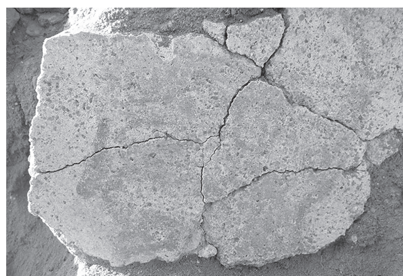
Fig. 11: Abu Erteila, Temple K 1000, Inner facing of the southern perimeter wall, Detail of the painting on plaster depicting a human head.

Painted plaster also covered a red bricks two-steps structure set to south of the room K 1027, brought to light during the seventh season; 21 a middle body is flanked by two slightly projected same-sized wings (fig. 10). It was decorated with the representation of two groups including human and divine personages collocated on both its lateral sides; of such figures only the legs and part of the feet are now visible. Furthermore the reproduction of bows can be noticed on the steps: they symbolized enemies of the kingdom that were crushed underfoot confirming the royal supremacy and the full control on all the dominions of the reign.