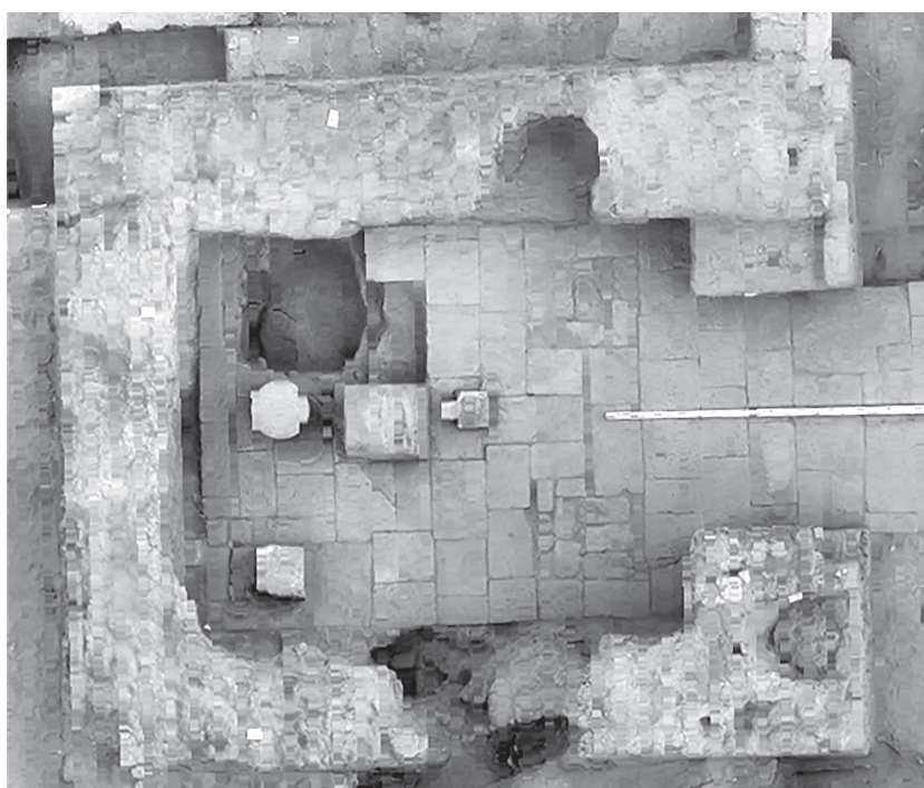
Fig. 2: Abu Erteila, Temple K 1000, Naos, View from above.