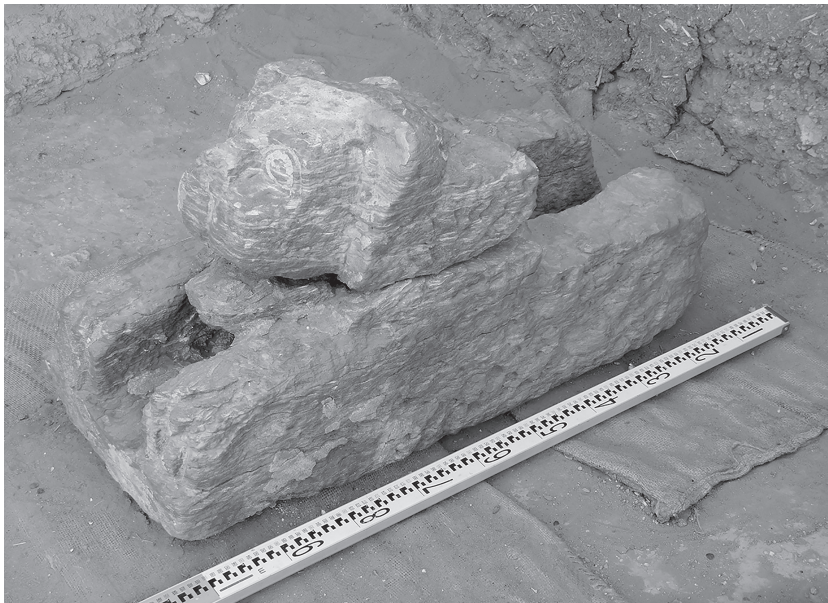
Fig. 5: Abu Erteila, Temple K 1000, Naos, Water spout.

tion is suggested by the finding of votive objects, as a bronze ring bearing a gryphon, 13 two sandstone lion statuettes 14 and faience beads.