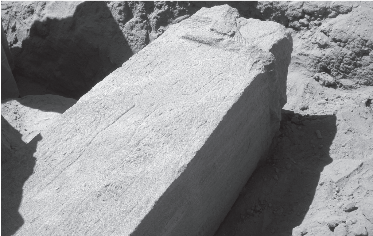
Fig. 4: Abu Erteila, Temple K 1000, Naos, Stand.