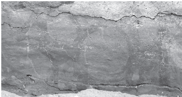
Fig. 9: Abu Erteila, Temple K 1000, Outer facing of the southern perimeter wall, Detail of the painting on plaster depicting a solar disk flanked by an ibis and a sphinx.