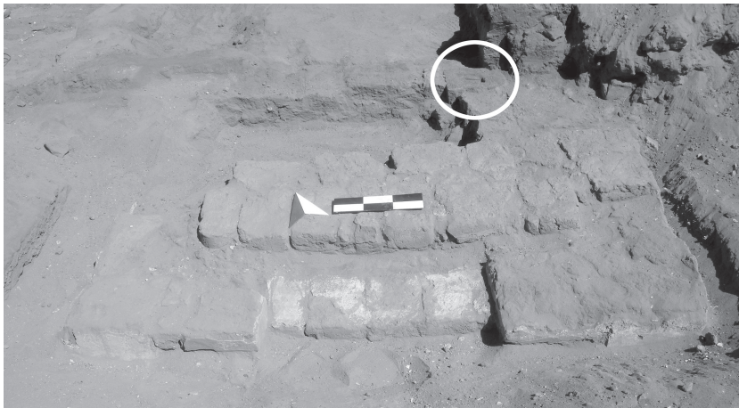
Fig. 10: Abu Erteila, Temple K 1000, Two-steps structure to south of K 1027. Behind it, on the right, is visible on the planking level the square door housing put in correspondence of the entrance to K 1027.