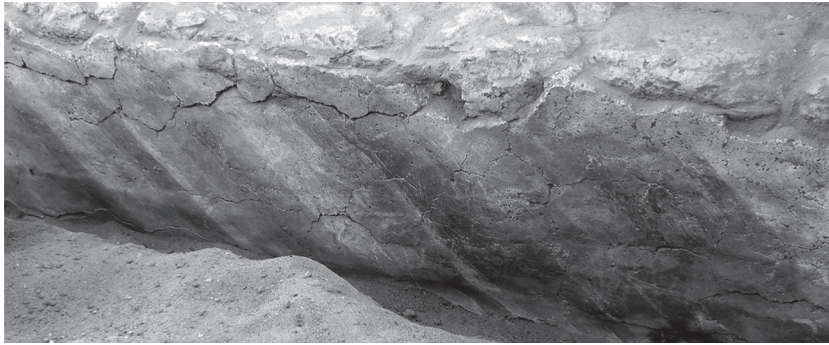
Fig. 8: Abu Erteila, Temple K 1000, Outer facing of the southern perimeter wall, Detail of the painting on plaster depicting sunbeams.

In addition to the several column drums and the open papyrus capital found in 2014, a new fragment sized 40x28 cm came to the light in the temple. Its decoration shows the king and a god represented shoulder to shoulder. The unknown divine personage is here reproduced holding in his right hand an ankh sign (fig. 6).